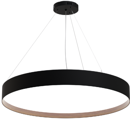
Suspended - 48" Luminaire