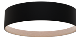
Surface Mount - 24" Luminaire